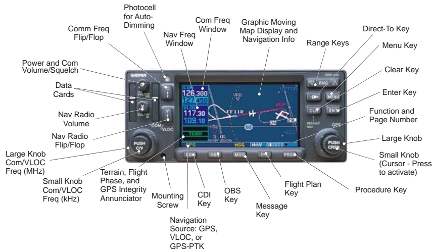
Figure 1 - 400W Series Control and Display Layout

Optional VHF Com and VHF Nav radio functions are controlled via dedicated buttons and knobs on the left side of the display and adjacent to frequencies they are controlling.